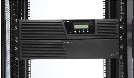
Add up to four EBMs for hours of runtime