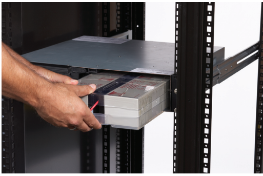
Hot-swappable internal batteries in only 2U