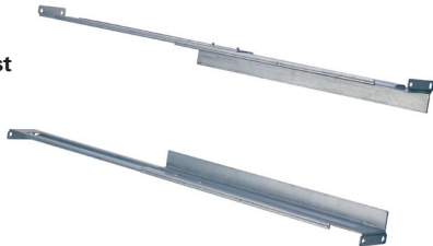
Four-post rail kit included (two-post rail kit optional)