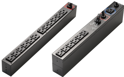
Optional FlexPDU and HotSwap MBP for greater flexibility and uptime