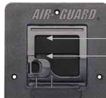
EPDM Gasket Material