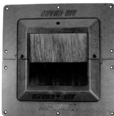
Application: AIRGUARD Adapt with Surface Mount