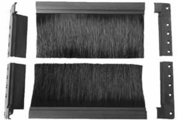
AIRGUARD Flush Mount, showing components