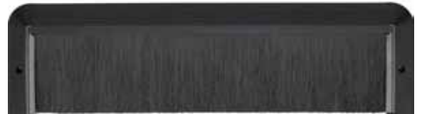
AIRGUARD Surface Mount, showing components