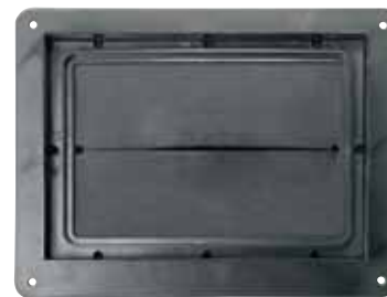
AIRGUARD Extreme Bottom, showing gasket material