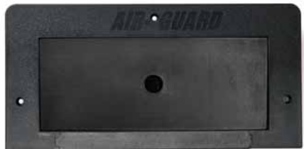
AIRGUARD® Flush Mount with Safety Cover