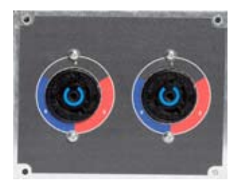
L21-20R*, L21-30R, L15-20R, L15-30R