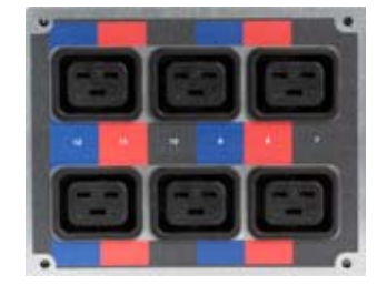
IEC320-C19 (208V)*, IEC320-C19 (230V)