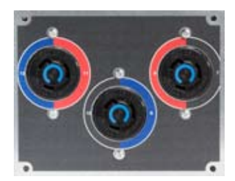
L6-15R, L6-20R*, L6-30R, L14-20R, L14-30R